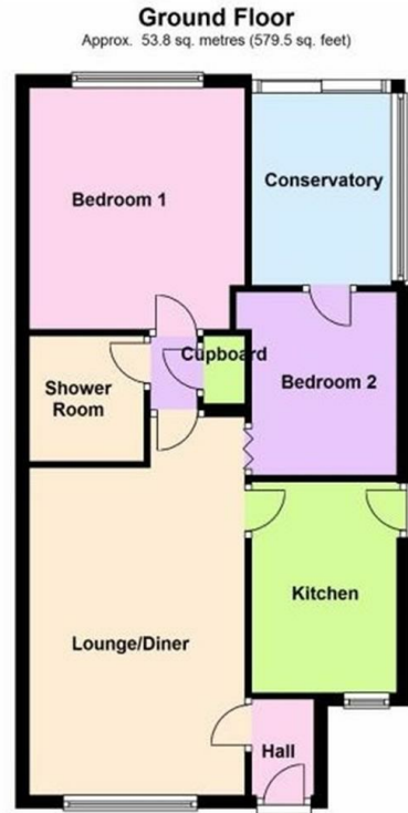
Total area: approx. 53.8 sq. metres (579.5 sq. feet)