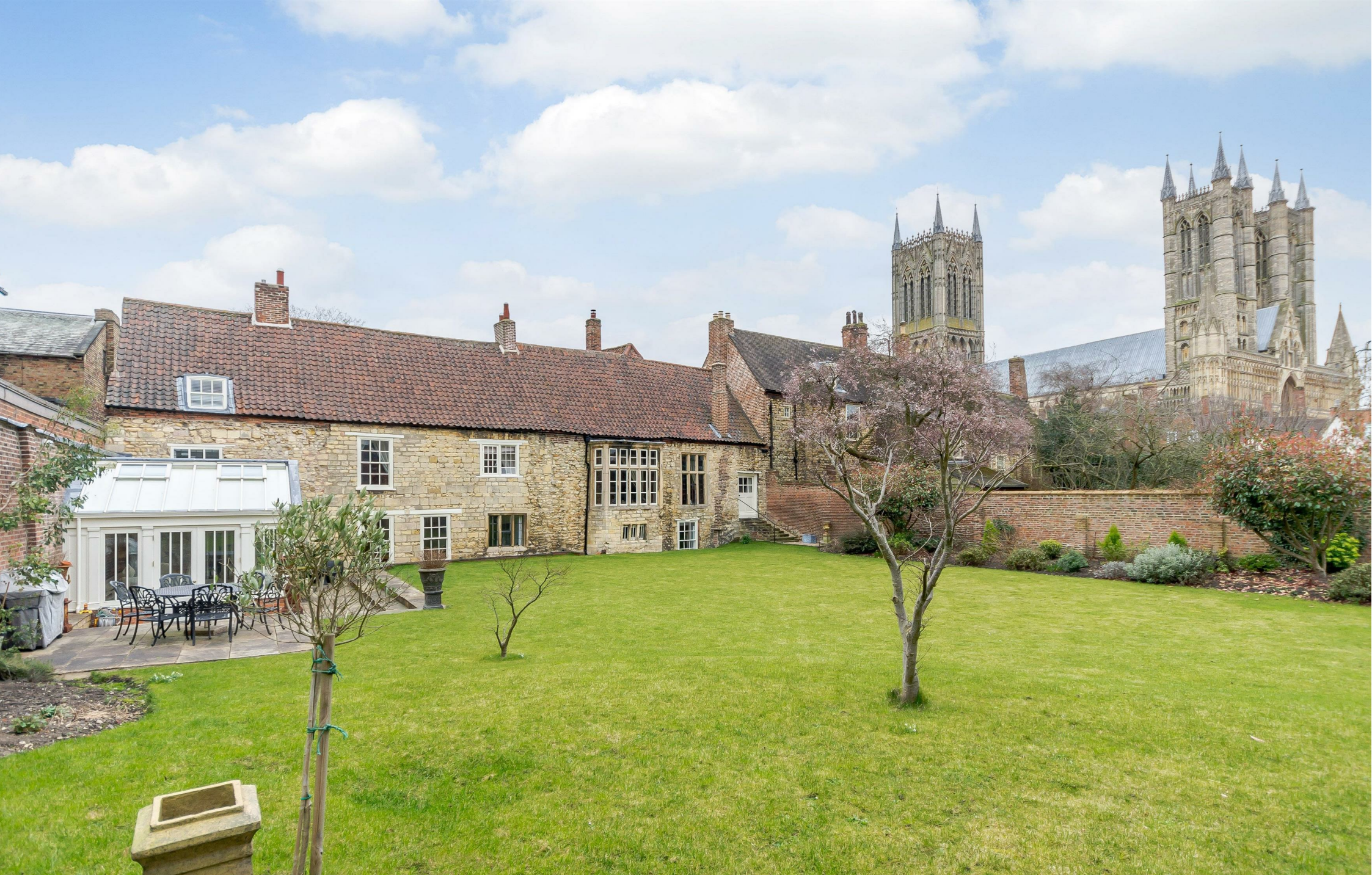
Deloraine Court, James Street Lincoln