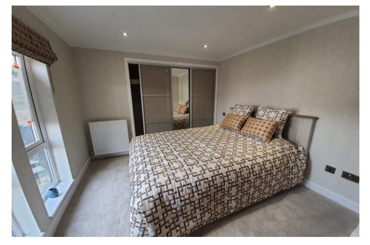
Please note: Stock image have been used, the home on site may vary.