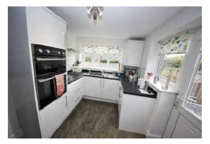
UTILITY 2.75 x 1.43 (9'0" x 4'8") Range of fitted units and work surfaces. Stainless steel sink unit and single drainer. Large storage cupboard. Combi boiler