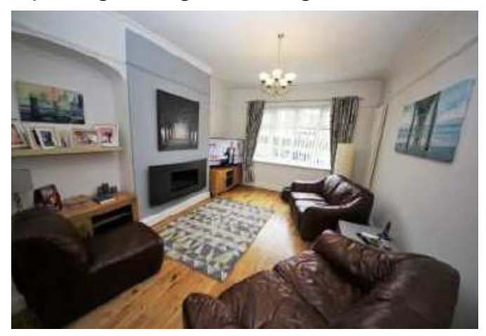
DINING ROOM (rear) 4.15 x 3.66 (13'7" x 12'0")

Central heating radiator. Wood floor. Opening through to dining room.