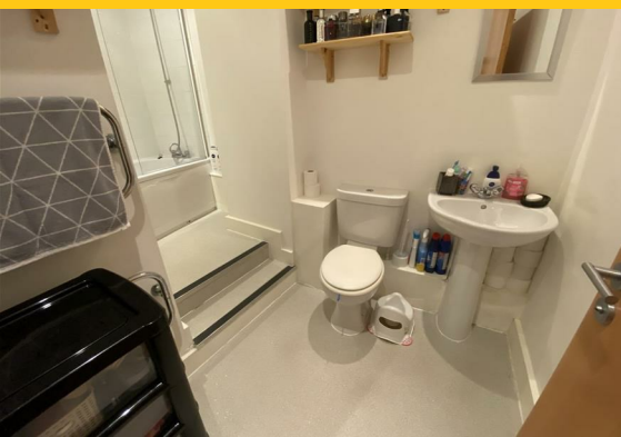
WC, pedestal sink, towel heater, tiled splashback.