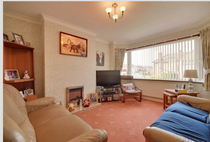
Double glazed bay window to front and radiator.