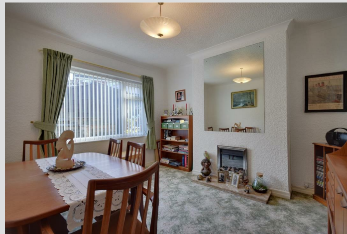
Double glazed window to rear and radiator.