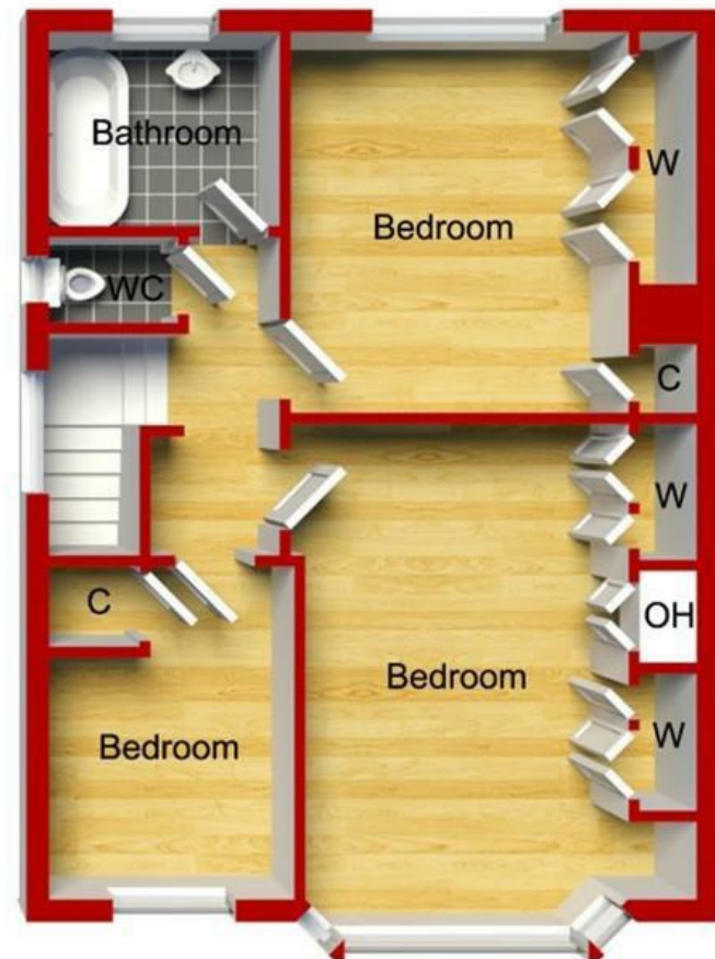
First Floor Approximate Floor Area (43.90 sq.m)