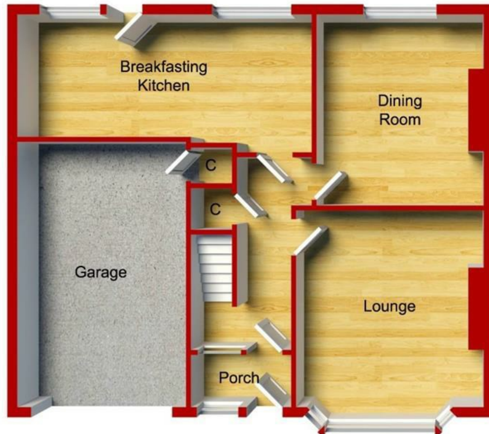
Ground Floor Approximate Floor Area (51.72 sq.m)