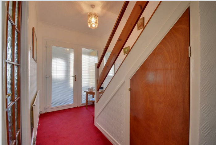
Staircase to first floor and radiator.