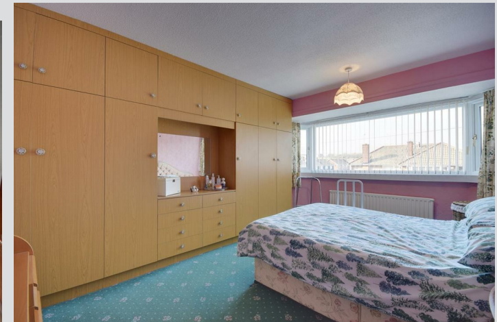
Double glazed bay window to front, radiator and fitted wardrobes.

Visit www.peterheron.co.uk or call 0191 510 3323