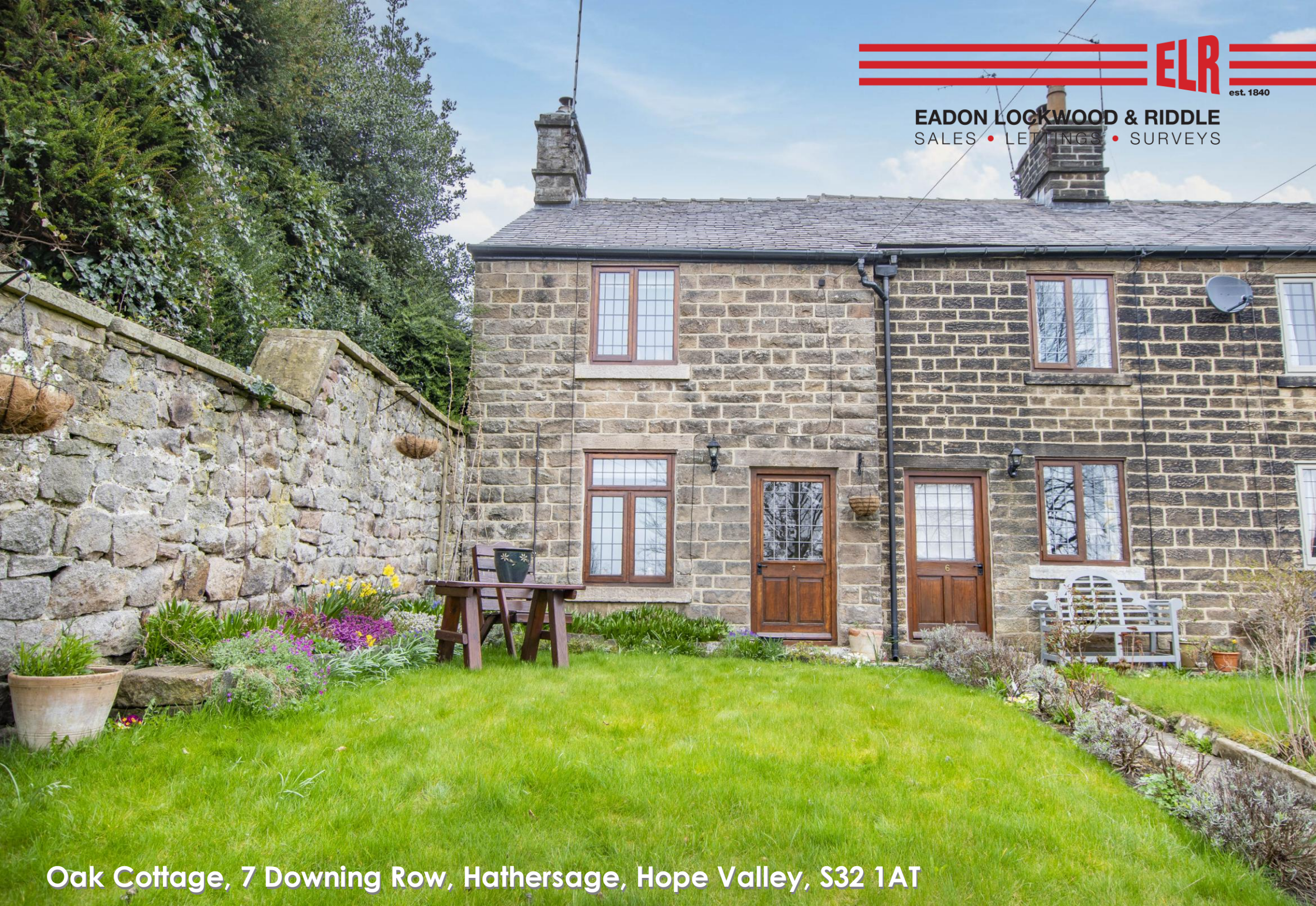
Oak Cottage, 7 Downing Row, Hathersage, Hope Valley, S32 1AT