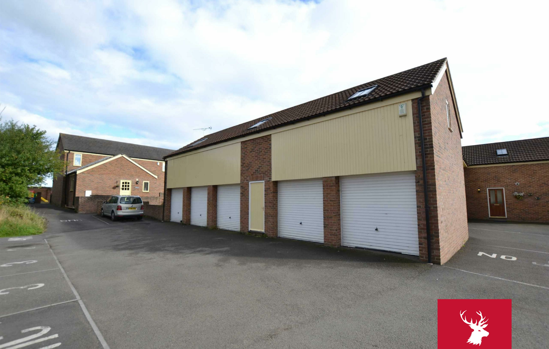
The Coach House