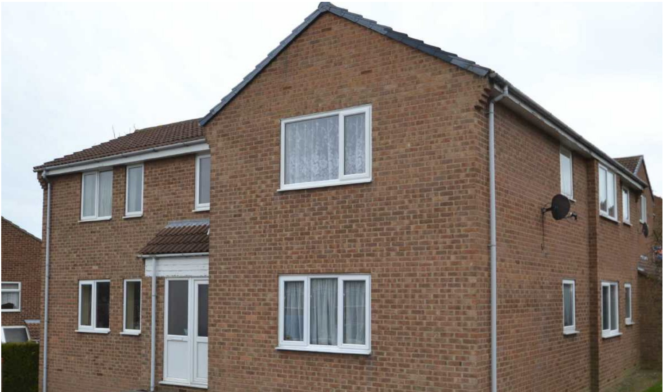
Oak Lodge, Flat 1 31 Settrington Road Scarborough YO12 5DL