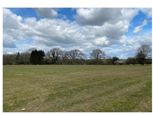
Old Camp Farm Barns, Brighton Road, Monks Gate, West Sussex Guide Price £895,000 Freehold