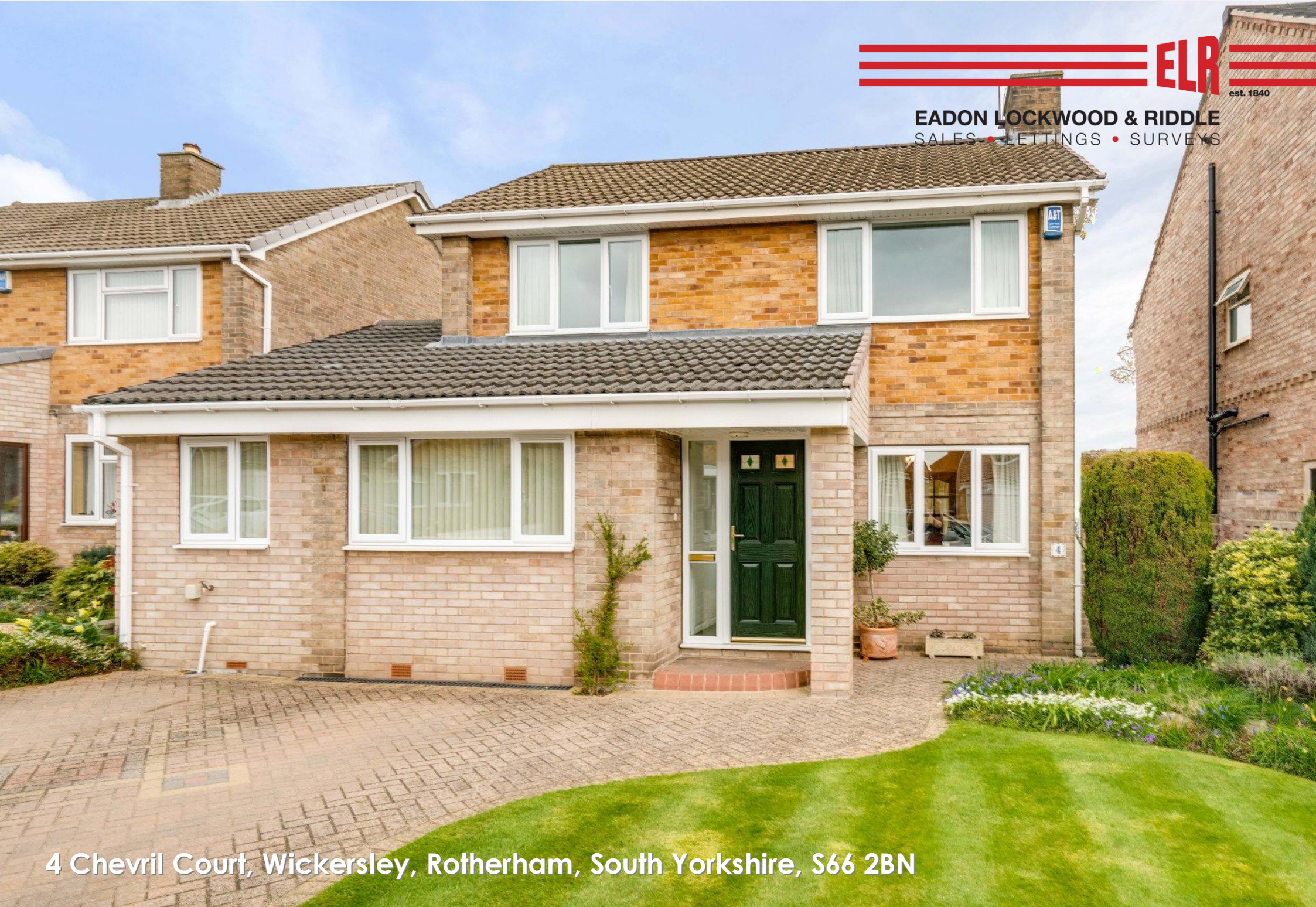
4 Chevril Court, Wickersley, Rotherham, South Yorkshire, S66 2BN