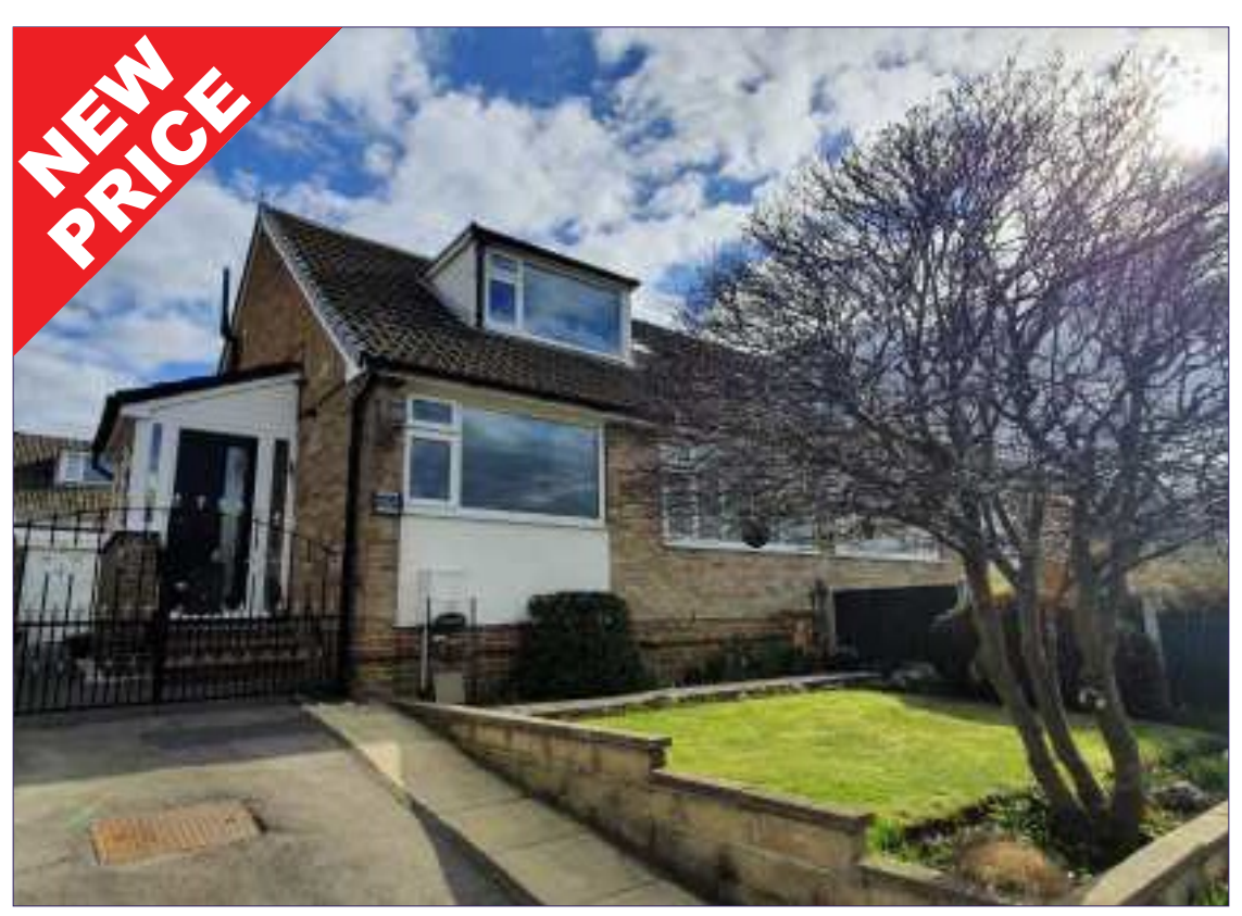
26 Cherry Tree Drive, Farsley, LS28 5SR

36 Town Street, Farsley, Leeds, West Yorkshire, LS28 5LD Telephone: 0113 2040 322 Fax: 0113 2560 899 Email: info@julieshomes.co.uk www.julieshomes.co.uk