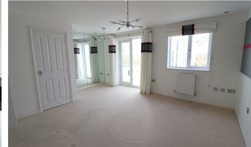
FAIRFIELDS, PROBUS £950 PCM