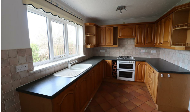
THE FORGE, CARNON DOWNS £1,100 PCM