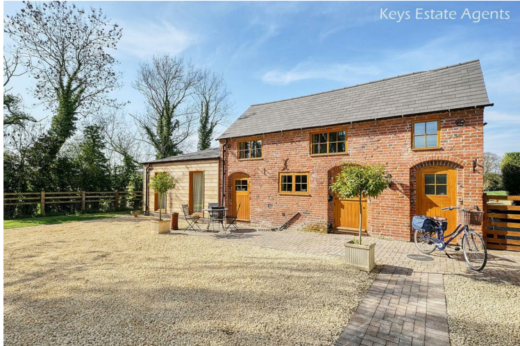
COACH HOUSE 1

shower room (2.5m x 1.5m) and an open plan living space with a kitchen area (4.8m x 3.6m), outside there is a sitting area.