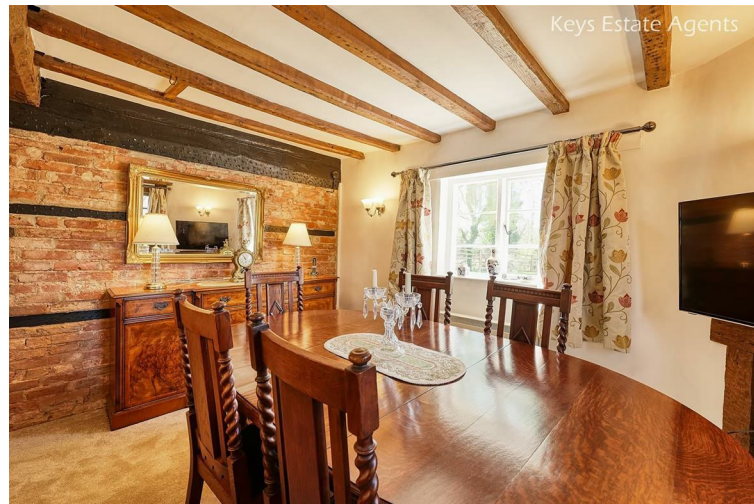
THE COACH HOUSE

The Coach House is ground floor accommodation with a staircase leading to a mezzanine.