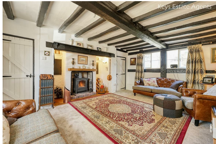
THE COTTAGE 2