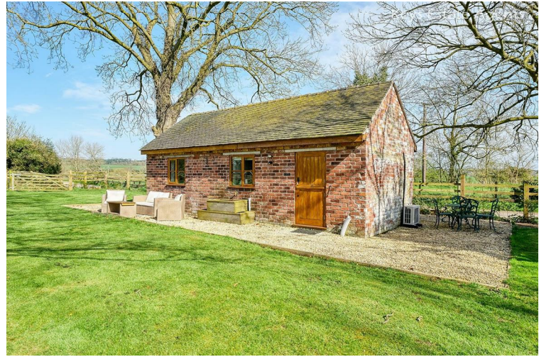
GARAGE (GUEST COTTAGE) 1

shower room (2.5m x 1.5m) and an open plan living space with a kitchen area (4.8m x 3.6m), outside there is a sitting area.