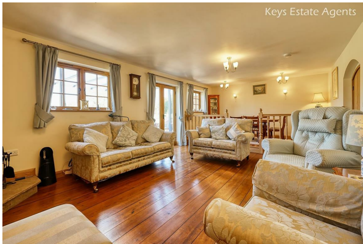
COACH HOUSE 2