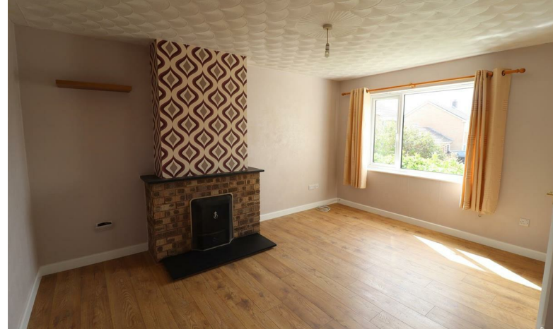
Bosvean Road, Shortlanesend £875 pcm