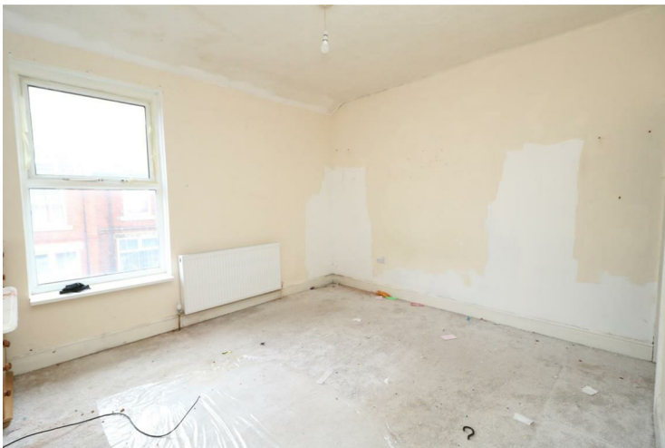
FRONT BEDROOM 12'11" x 11'5" (3.94 x 3.5)