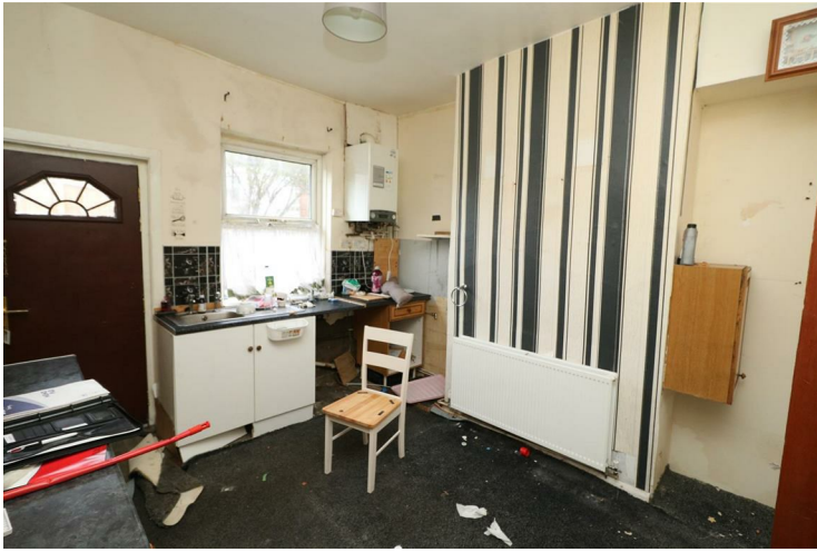
KITCHEN 11'5" x 13'0" (3.48 x 3.97)

With Ariston gas combination boiler and double panelled radiator.