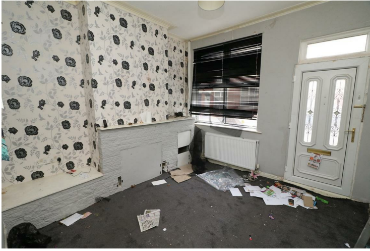
LIVING ROOM 11'5" x 11'5" (3.48 x 3.49)