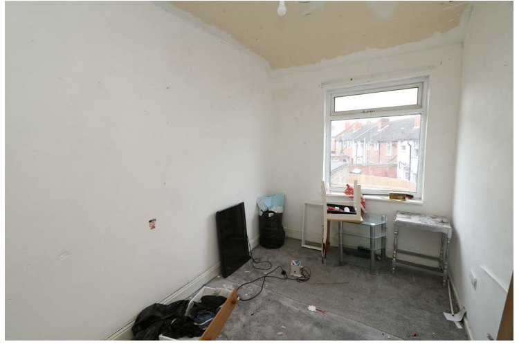
REAR BEDROOM 7'7" x 12'11" (2.32 x 3.94)