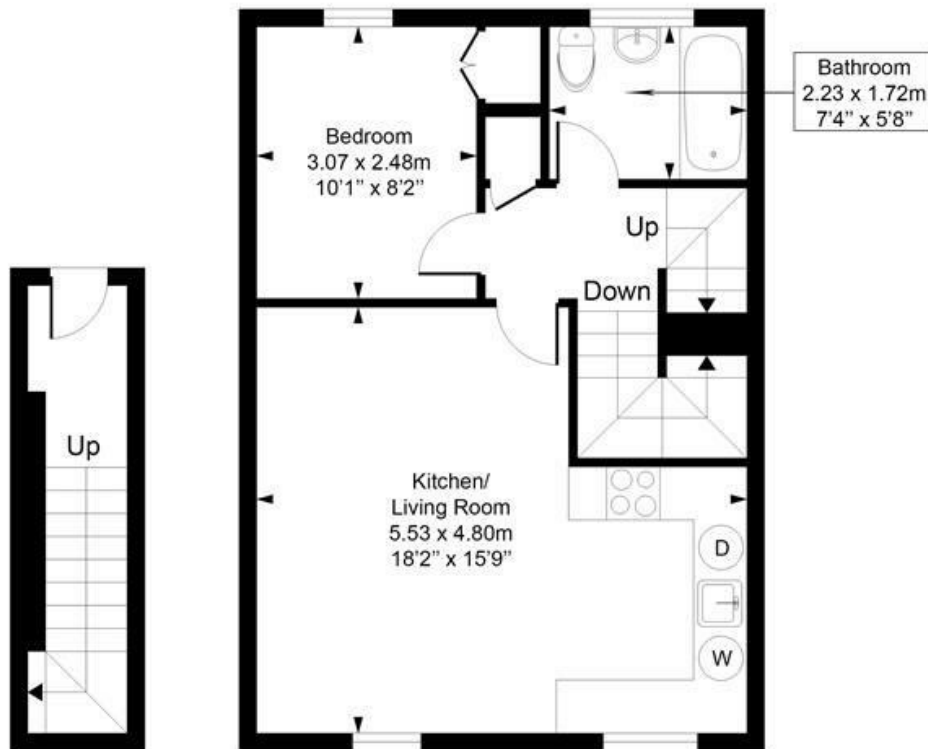
Raised Ground Floor