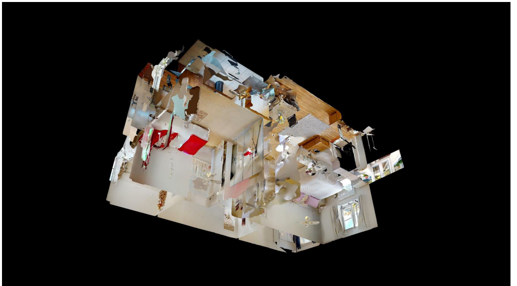
8 KINSON WAY, DOVER