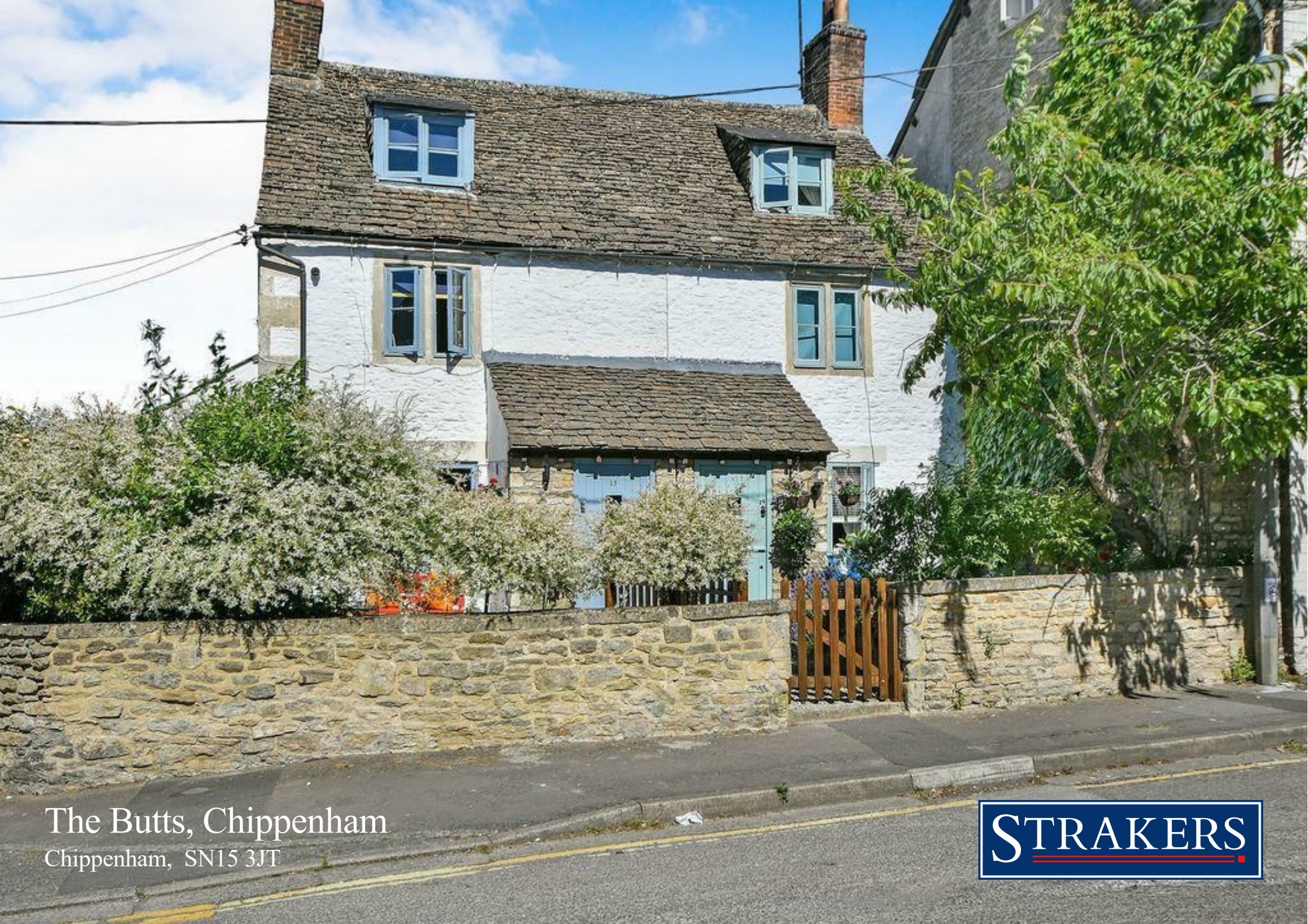
The Butts, Chippenham Chippenham, SN15 3JT