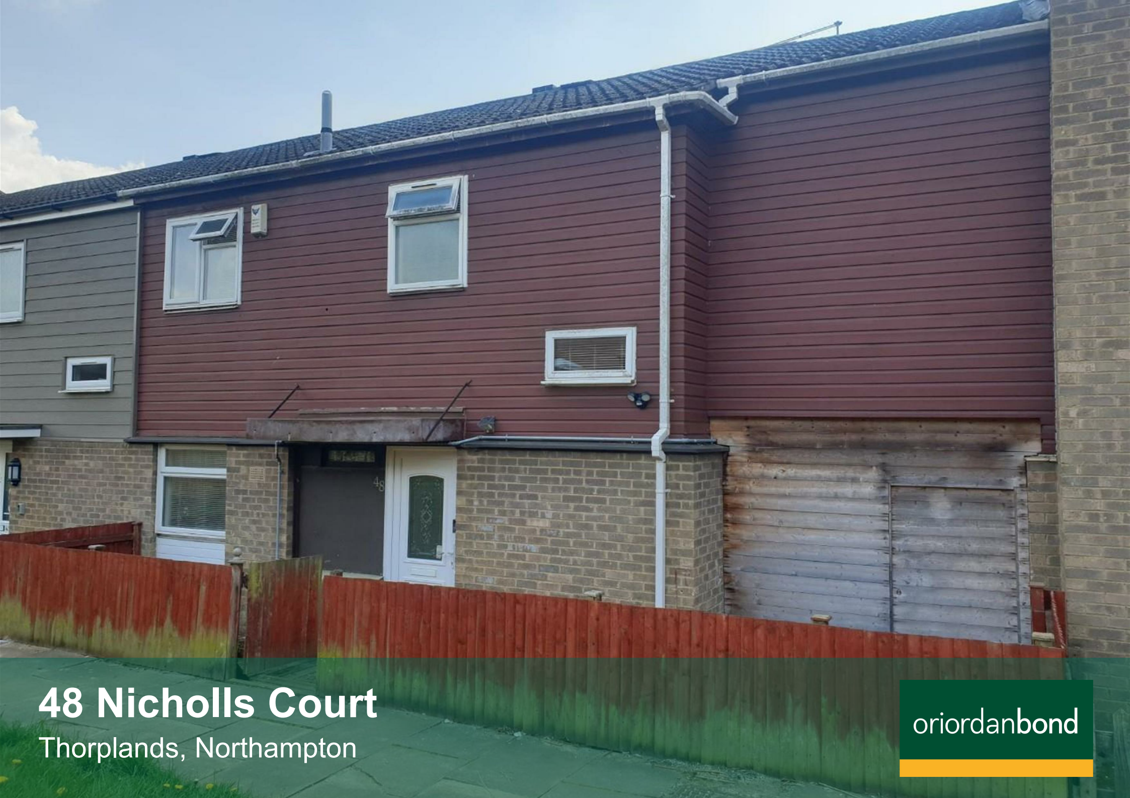
48 Nicholls Court Thorplands, Northampton