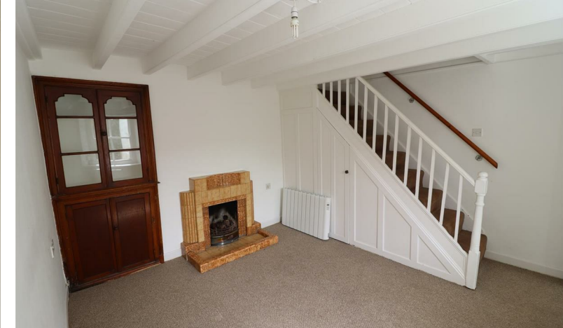
OLD CARNON HILL, TRURO £750 PCM