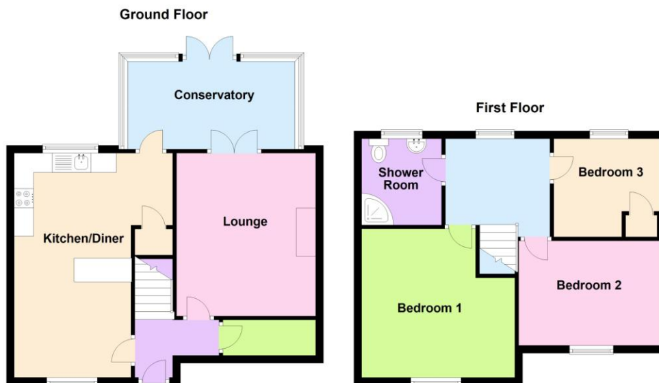
For illustration purposes only. Plan produced using PlanUp.

Regulated by RICS. Mundy's is the trading name of Mundy's Property Services LLP registered in England NO. OC353705. The Partners are not Partners for the purposes of the Partnership Act 1890. Registered Office 29 Silver Street, Lincoln, LN2 1AS.