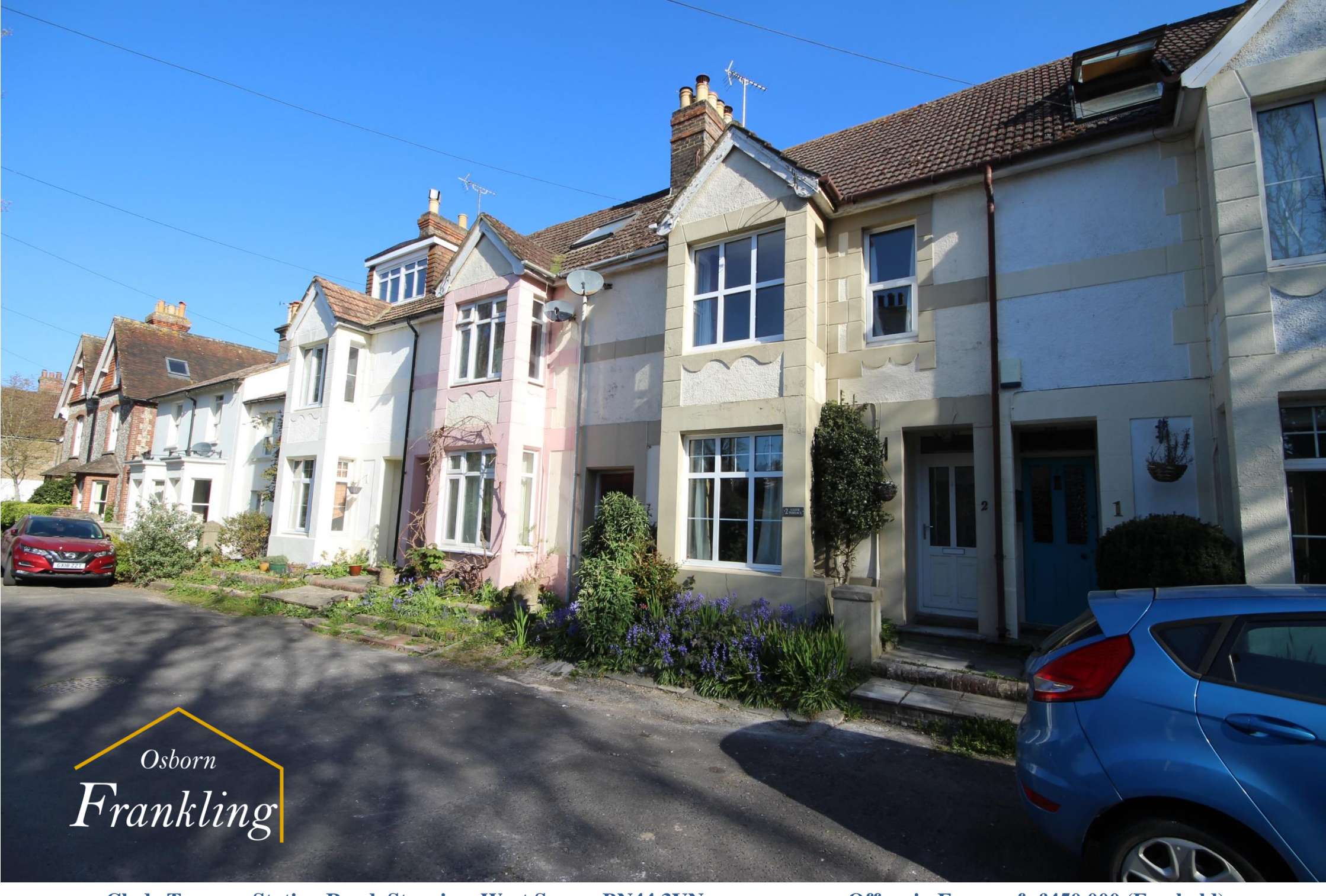
Clyde Terrace, Station Road, Steyning, West Sussex BN44 3YN