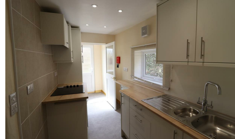
COOMBE TERRACE, BISSOE, TRURO £795 PCM