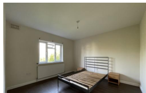
Raglan Court Empire Way, Wembley, , HA9 0RG