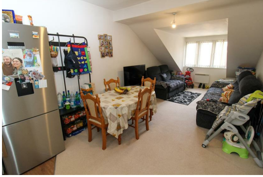
Open Plan Living 10'5" x 27'10"