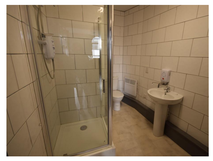
SHOWER ROOM White suite comprising low level WC, wash hand basin and shower cubicle. Tiled walls, vinyl flooring, wall mounted electric heater.