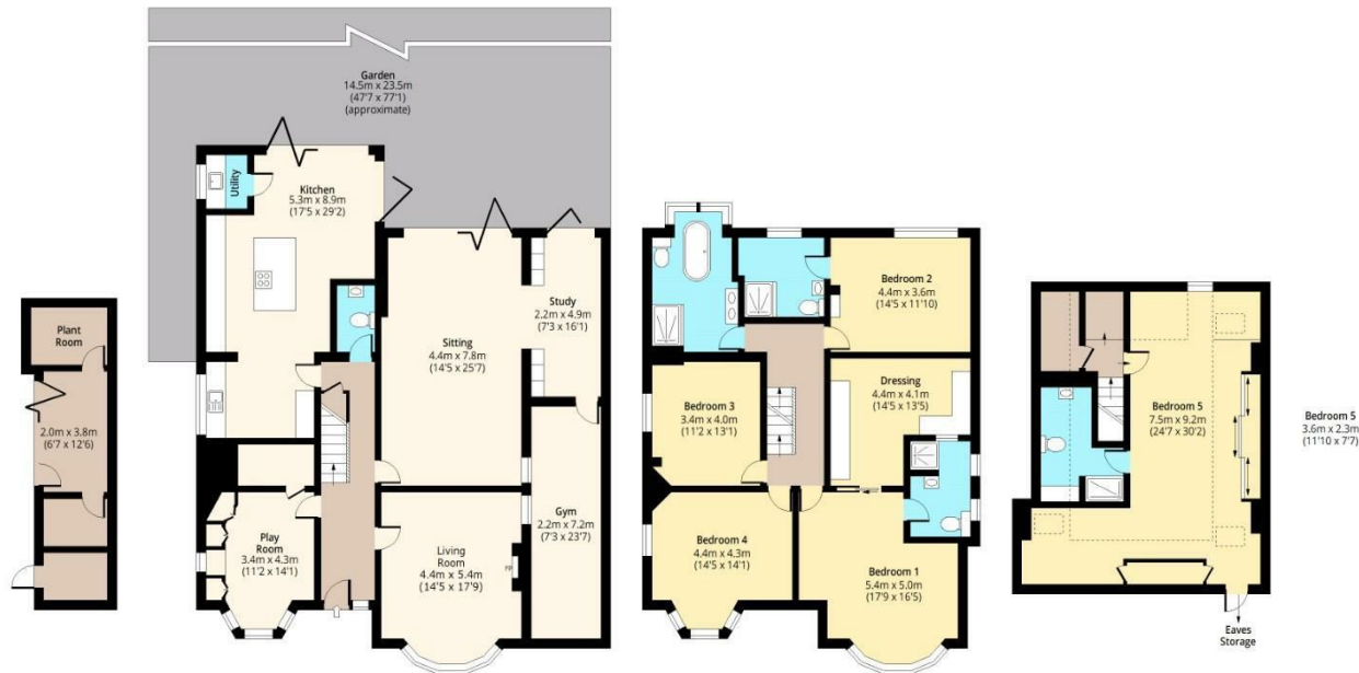
Second Floor Approx. 85 Sq. meters (900 Sq. feet)

Total area: approx. 373 Sq. meters (4016 Sq. feet) (Including Outbuilding) Total area: approx. 354 Sq. meters (3811 Sq. feet) (Excluding Outbuilding) For illustration purposes only - not to scale www.japplus.com