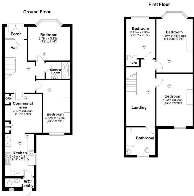
1 Derry Avenue, Mutley, Plymouth