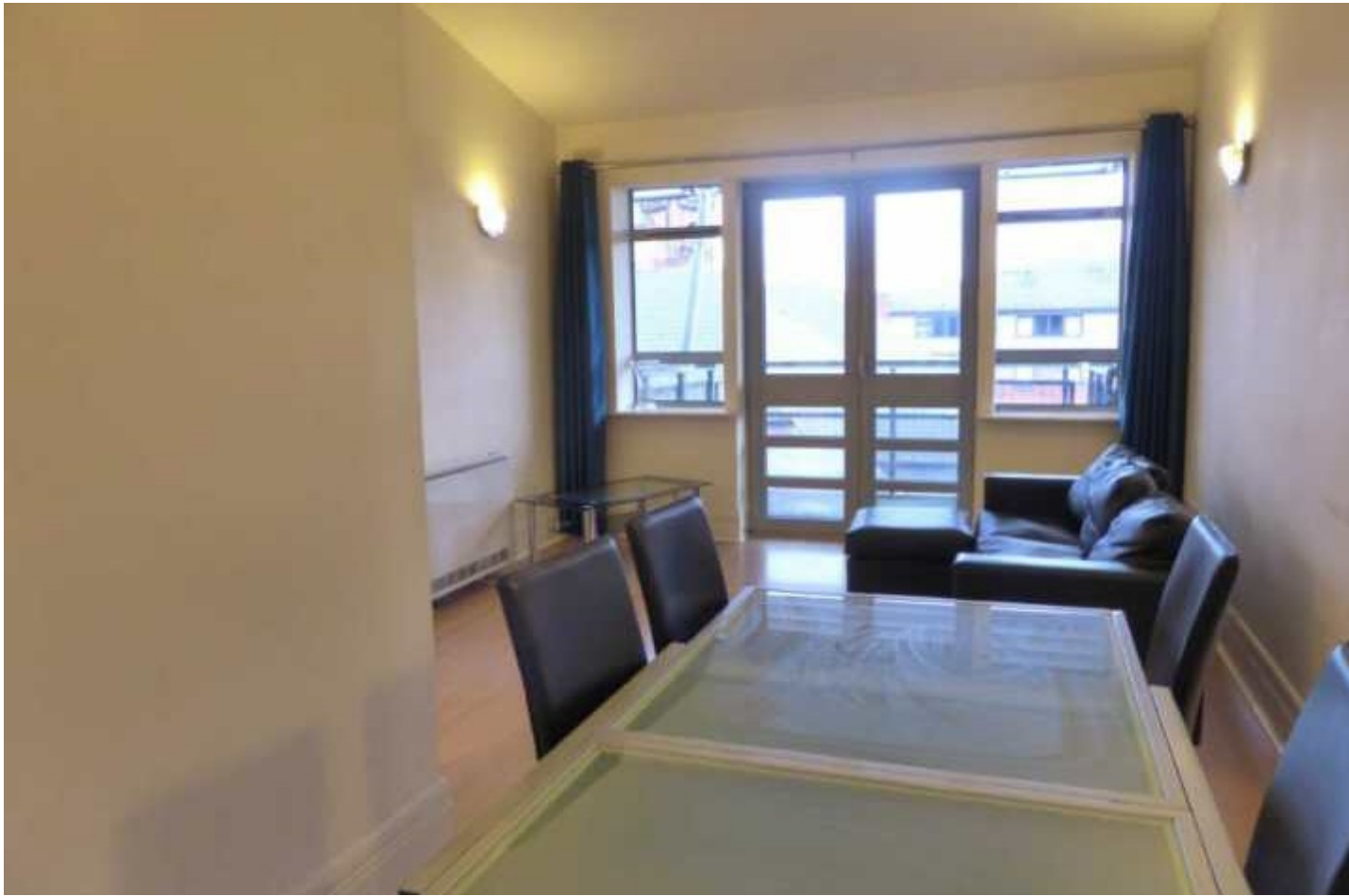
Stonebridge House, Manchester M1 3GB £950 Per calendar month