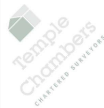
TOTAL FLOOR AREA: 69.8 sq.m. (751 sq.ft.) approx. While every attempt has been made to ensure the accuracy of the floorplan contained here, measurements of doors, windows, walls and any other items are approximate and no responsibility is taken for any error, omission or mis-statement. This plan is for illustrative purposes only and should be treated as such for any prospective purchaser. The services, systems and appliances shown here may not be fitted and no guarantee is given for their operability or efficiency at the time. Made with Metaphor (2021)