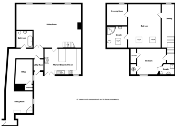
7A Pike Street, Liskeard, Cornwall