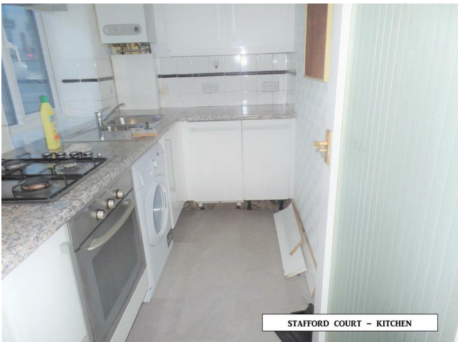
STAFFORD COURT - KITCHEN