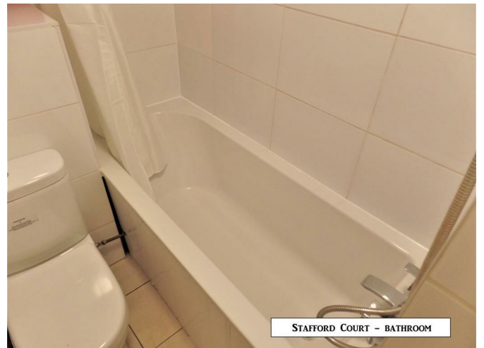
STAFFORD COURT - BATHROOM

These particulars, whilst believed to be accurate are set out as a general outline only for guidance and do not constitute any part of an offer or contract. Intending purchasers should not rely on them as statements of representation of fact, but must satisfy themselves by inspection or otherwise as to their accuracy. No person in this firm's employment has the authority to make or give any representation or warranty in respect of the property.