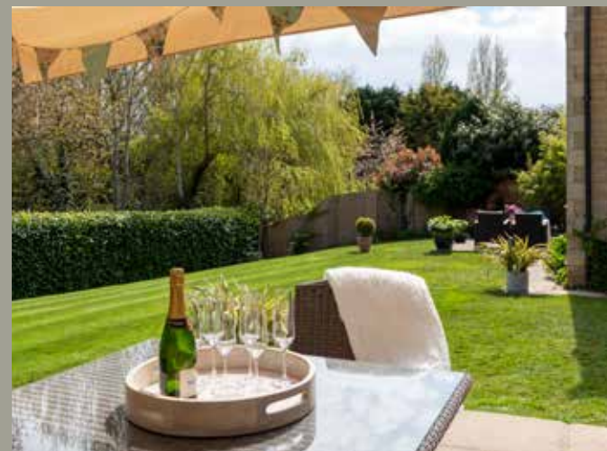
Baytree House, 7 Cricketers Green, Weldon NN17 3LP