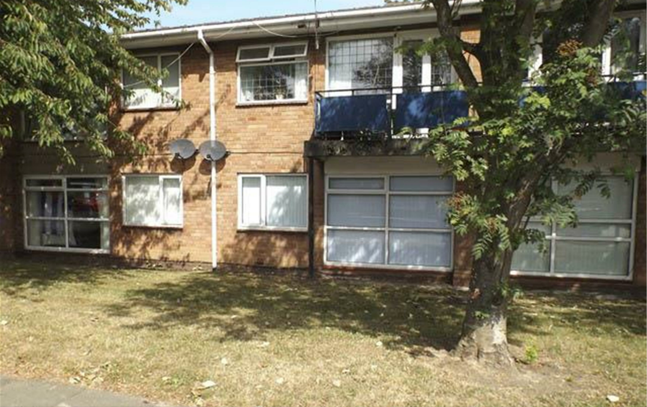
📍 Heathfield, Morpeth NE61 2TR