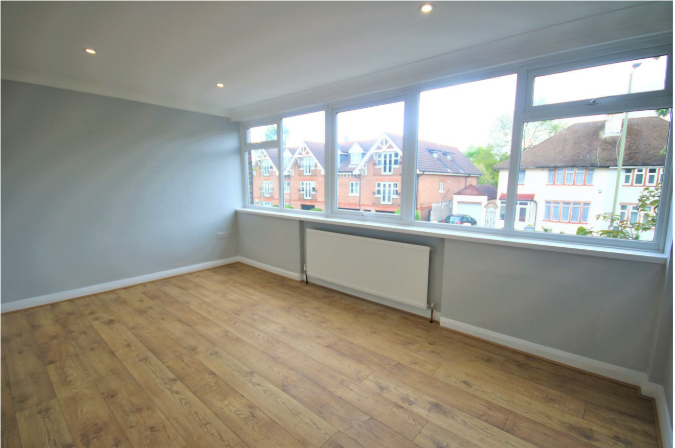
BEDROOM 2: 15'3 x 9'1 (4.65m x 2.77m)