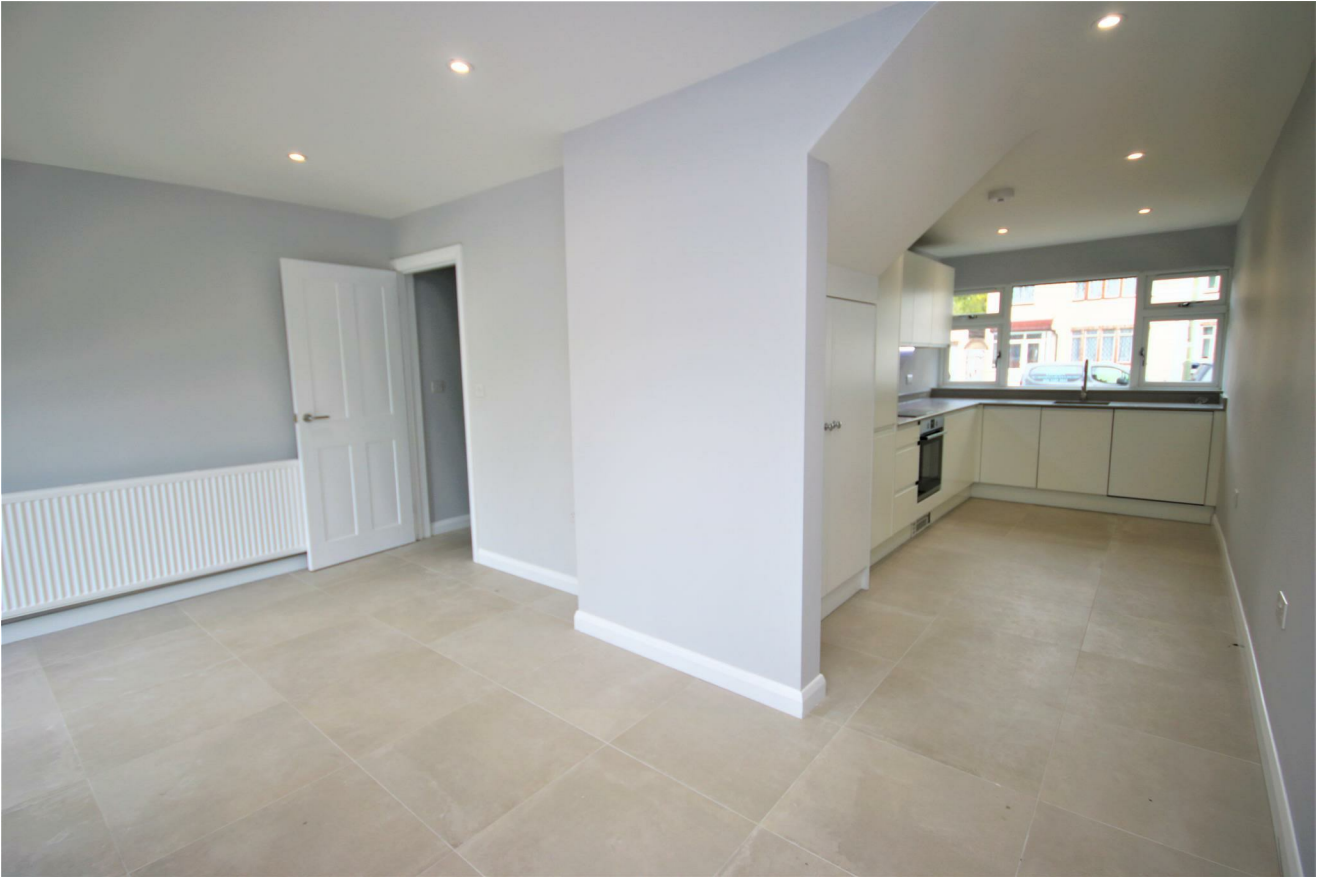
RECEPTION ROOM/BEDROOM 4: 15'3 x 13'1 max (4.65m x 3.99m max)