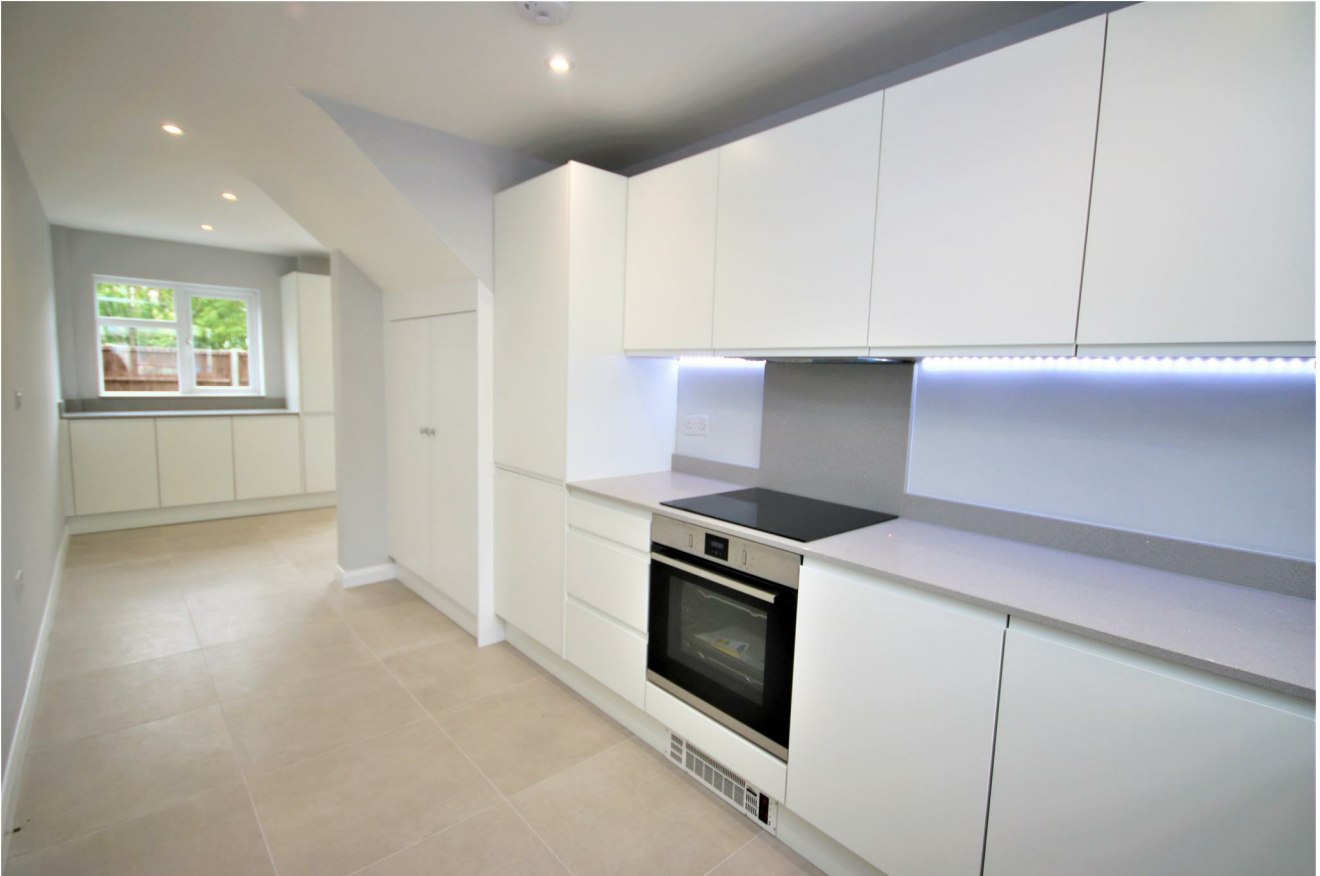
LUXURY FITTED KITCHEN/DINING ROOM: PIC. 2