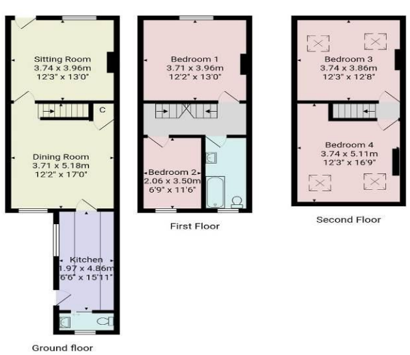
Total Area: 114.2 m<sup>2</sup> ... 1230 ft<sup>2</sup> All measurements are approximate and for display purposes only. to liability is accepted by either the agency or Box Property Solutions Ltd as to the exact measurements of the roon Box Property Solutions Ltd retains the copyright on this plan and allows agents to use it with agreed permission.