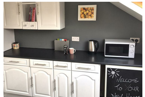
Room 6, 1 Park Grove, Saltaire, Shipley, West Yorkshire, BD18 4DR £425