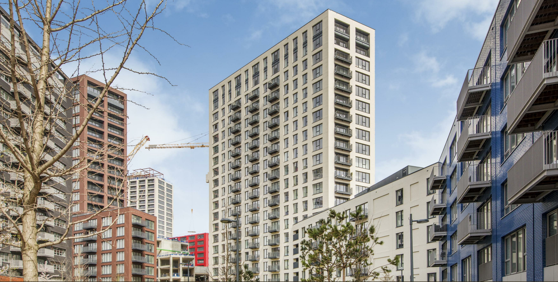
Grantham House, Canning Town London E14