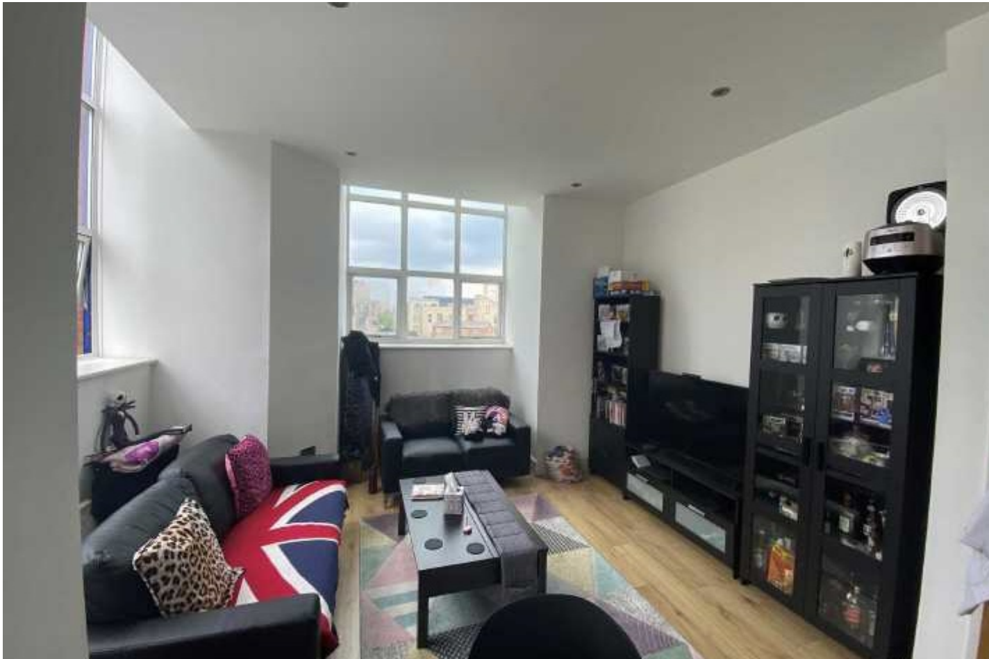
Albion Works, Ancoats M4 7DS Price £199,950