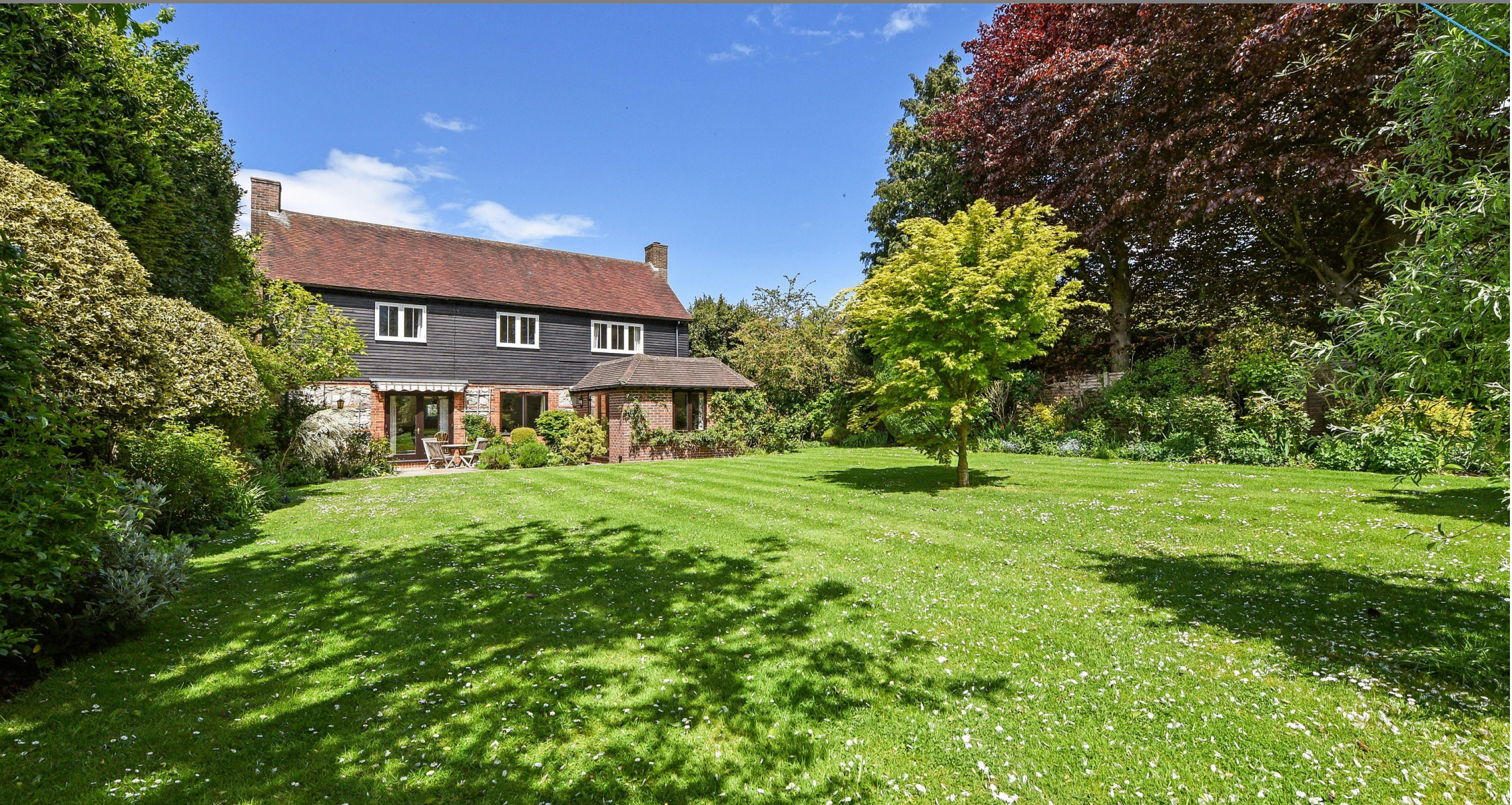
Down Street, West Ashling