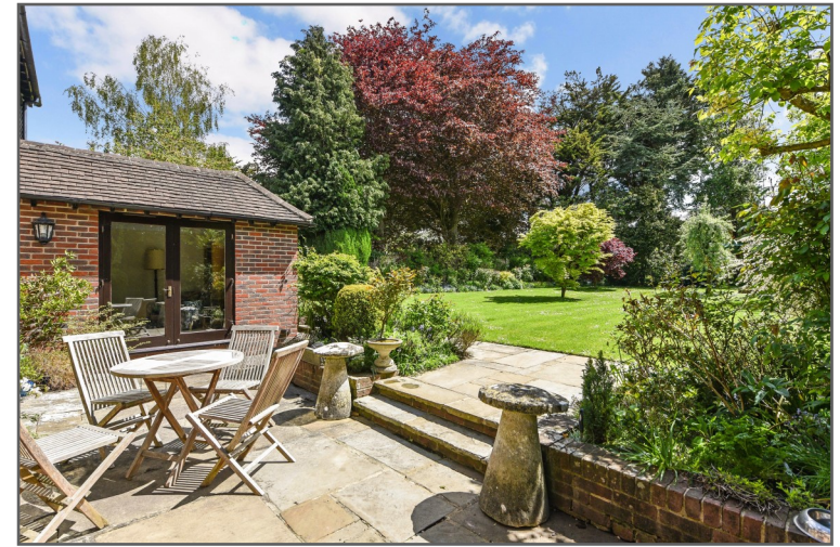
New Quinings, Down Street, West Ashling, PO18 8DS.