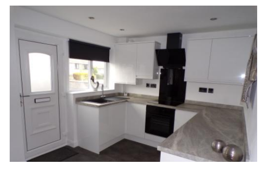
75 Pentland Avenue Clayton, Bradford, West Yorkshire, BD14 6JF