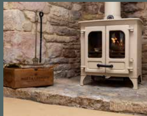
The Old Bakery, 2 Meadow Lane, Thornhaugh PE8 6HN