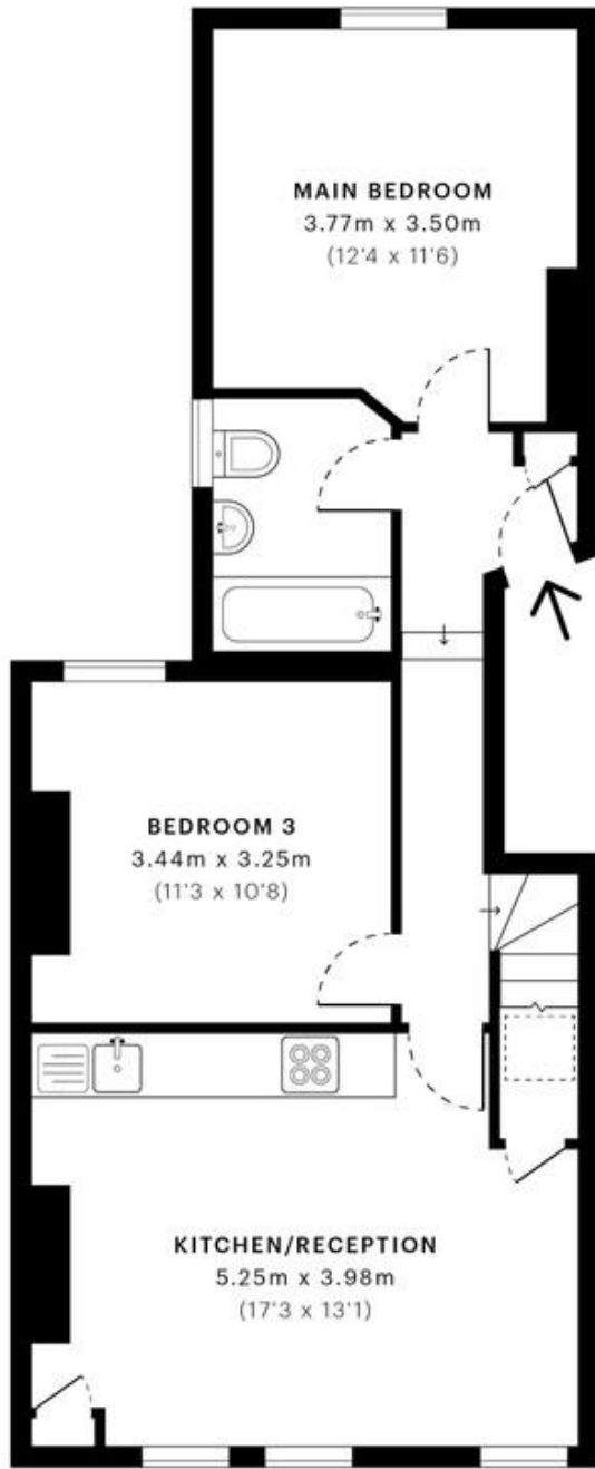
— First Floor