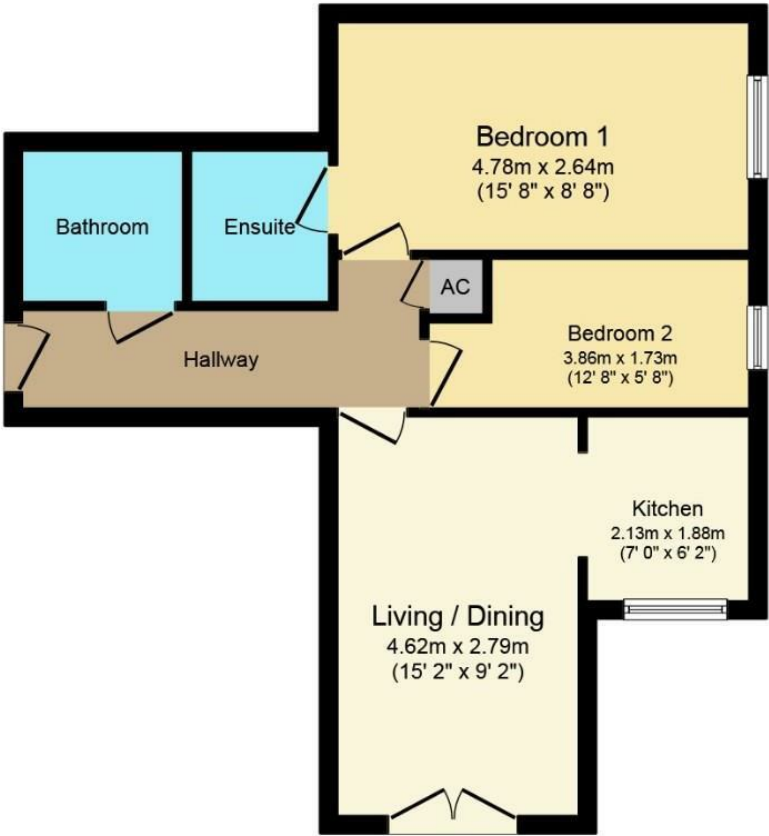
Floor area 49.8 sq. m. (536 sq. ft.) approx