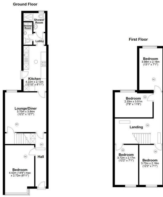
3 Manilla Rd, Selly Park, Birmingham