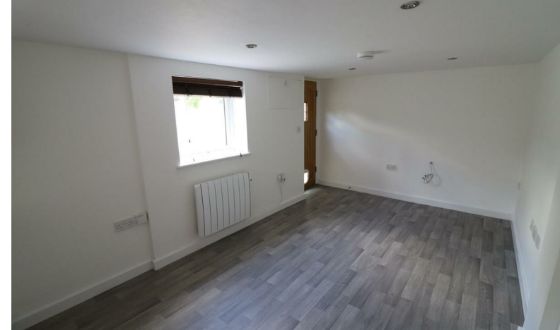
BOSVIGO ROAD, TRURO £850 PCM