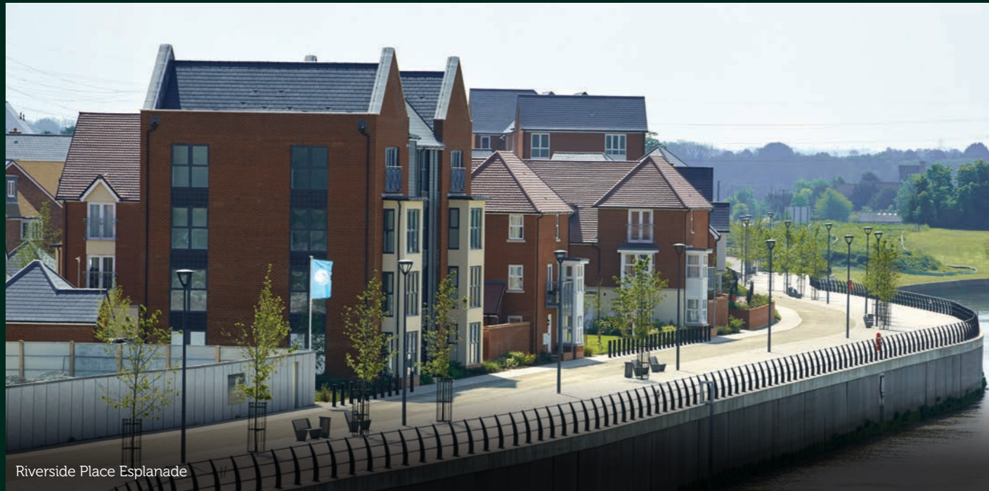
Riverside Place Esplanade