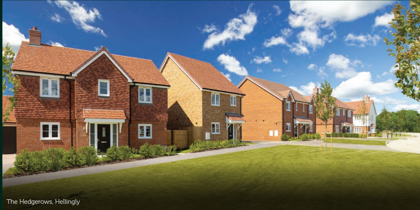
The Hedgerows, Hellingly