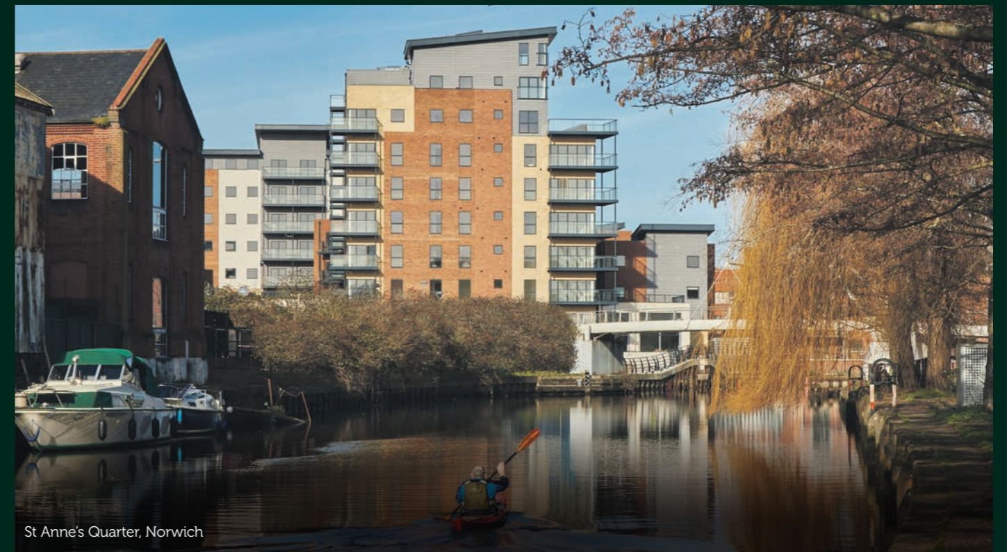
St Anne's Quarter, Norwich