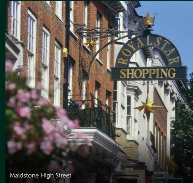
Maidstone High Street

Bedecked with colourful bunting, the picturesque high street of Rochester features a variety of independent speciality shops and attractive boutiques offering unusual gifts and souvenirs, presenting visitors with a unique and enjoyable shopping experience. Against such an aesthetically pleasing backdrop, you can relax and indulge in a spot of traditional café culture in one of the myriad coffee shops, tea rooms or restaurants that line the pavements.