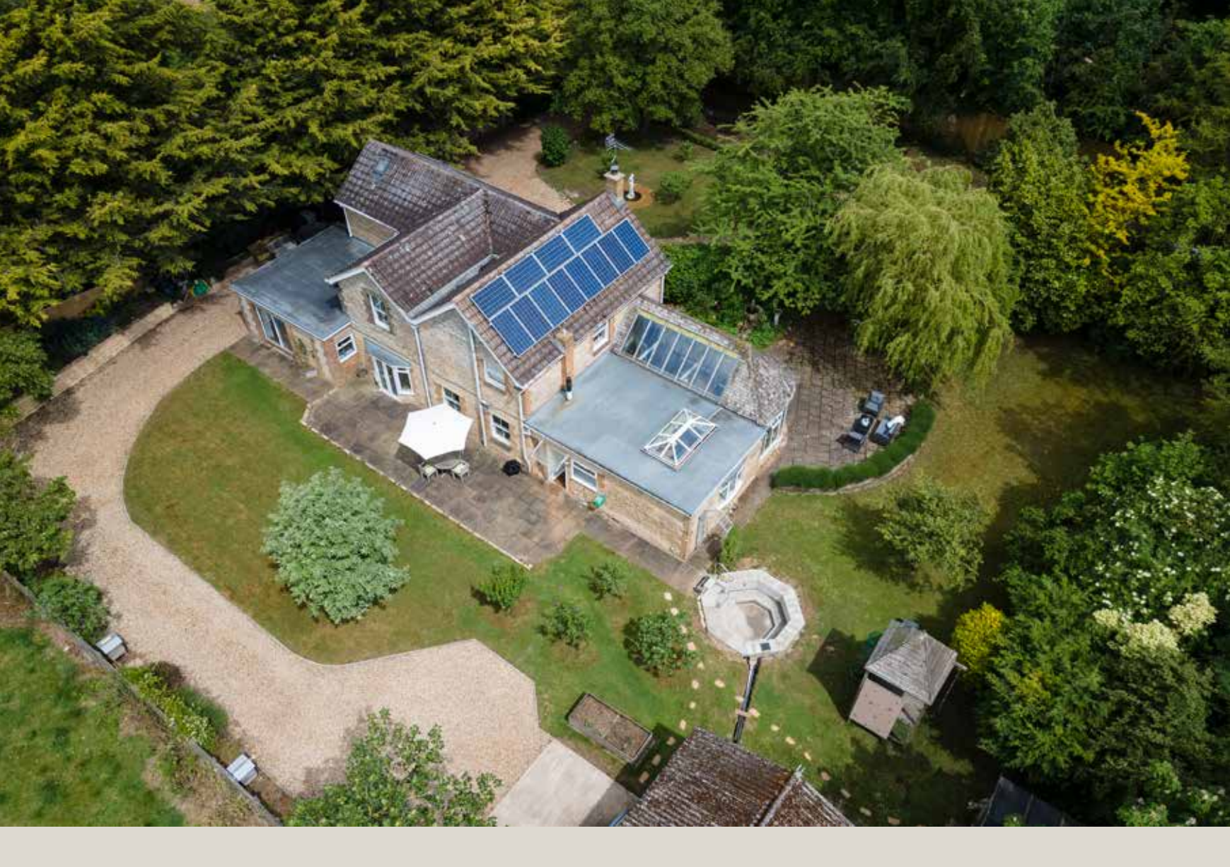
Sussex House, Empingham Road, Stamford PE9 3UH